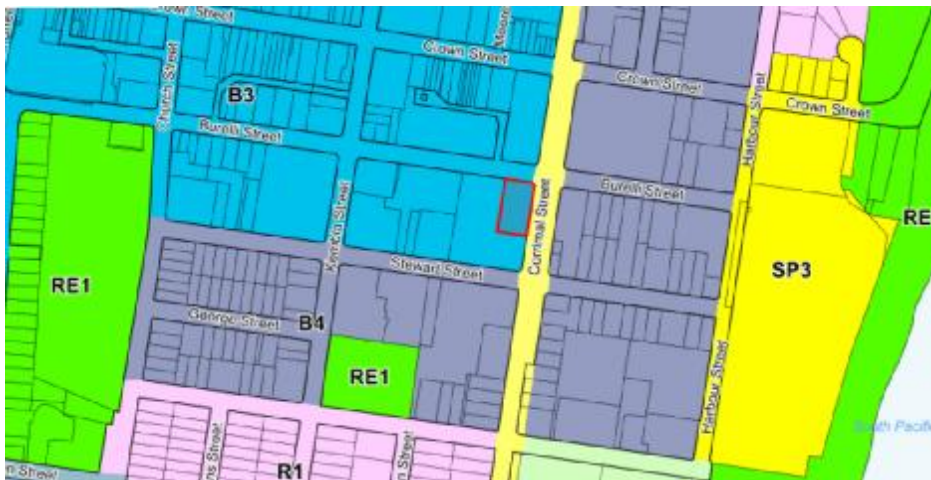
Figure 2: WLEP 2009 zoning map