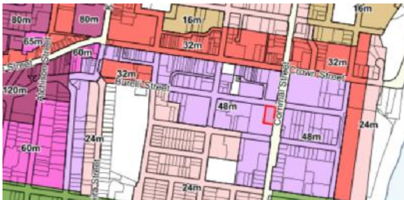
Figure 3: WLEP 2009 maximum height map